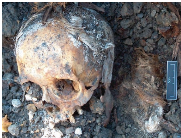
Fig. 24.3 The differential preservation of hair shown in-situ during the excavation of a 19th century burial in West Yorkshire, UK

century burials (Figs. 24.2 and 24.3). These contexts are varied in their preservation, particularly when you consider that these remains may be derived from both deep (sometimes waterlogged) urban deposits as well as crypts, and that coffin construction varies from wooden single shell to triple-shell, lead-lined coffins [95] and iron caskets [88], each of which has a contribution to the condition of hair and other organics held within.