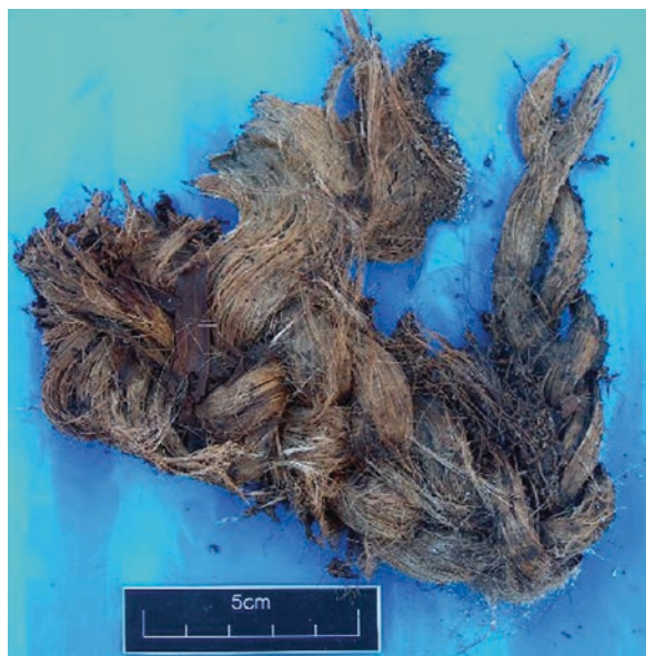
Fig. 24.2 Plaited hair recovered from a 19th century burial in West Yorkshire, UK

century burials (Figs. 24.2 and 24.3). These contexts are varied in their preservation, particularly when you consider that these remains may be derived from both deep (sometimes waterlogged) urban deposits as well as crypts, and that coffin construction varies from wooden single shell to triple-shell, lead-lined coffins [95] and iron caskets [88], each of which has a contribution to the condition of hair and other organics held within.